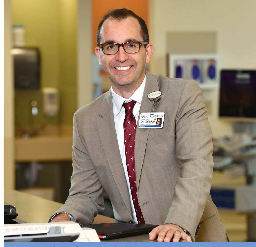
incision gallbladder operations and da Vinci and laparoscopic procedures. He says that while hernias cannot heal by themselves, the operation to repair a hernia is an outpatient procedure, and the patient returns home the same day.

• An indirect inguinal hernia is caused by a defect in the abdominal wall that is present at birth. It happens more often in boys than girls. Premature infants are also more likely to be born with this type of hernia. Although rarely an emergency, an indirect inguinal hernia should be